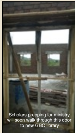
Scholars prepping for ministry will soon walk through this door to new GBC library

INDIA - Although the Monsoons have arrived in Central India, on drier days, construction workers have managed to push ahead and erect the second floor brick walls, as you can see in the pictures. We're very excited at the progress and soon the windows and doors will be going in. Thank you for your prayers and generous gifts which the Lord is using strategically in these students' lives.